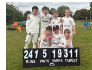
Our Victorious U9s after beating Tring Park