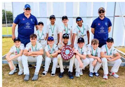
U12A's are County Champions again!