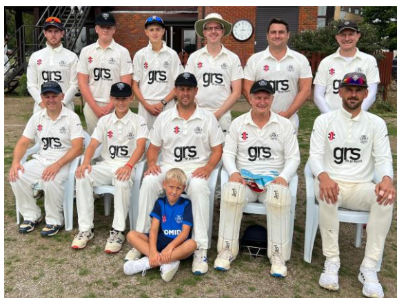
4th XI - Champions