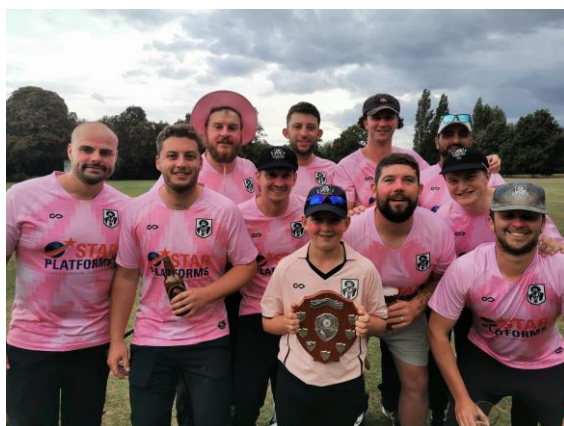
The Hemel Hundred Champions 2022 Radcliffe's Renegades

Radcliffe's Renegades won the final by 8 wickets with 6 balls to spare against Wright's Warriors. Doodson's Dynamos ended 3 rd and Miller's Musketeers (last year's winners) were 4 th .