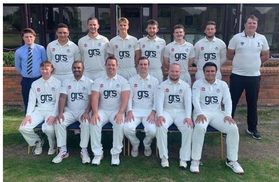
2nd XI – Runners-up