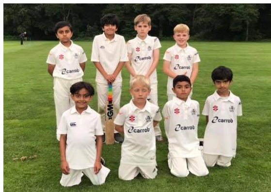
U9s enjoyed their first season