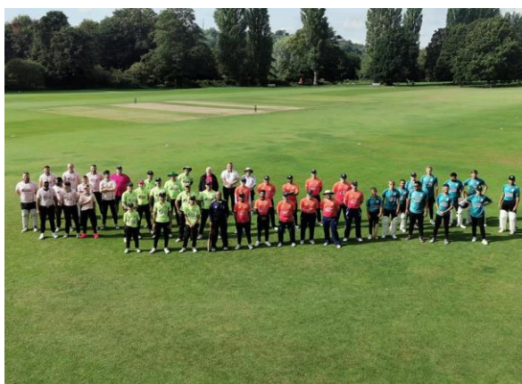
The Hemel Hundred Teams