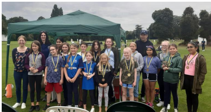
Grand Union Girls U11s with their medals