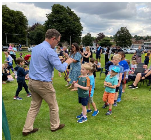
Allstars receiving their medals