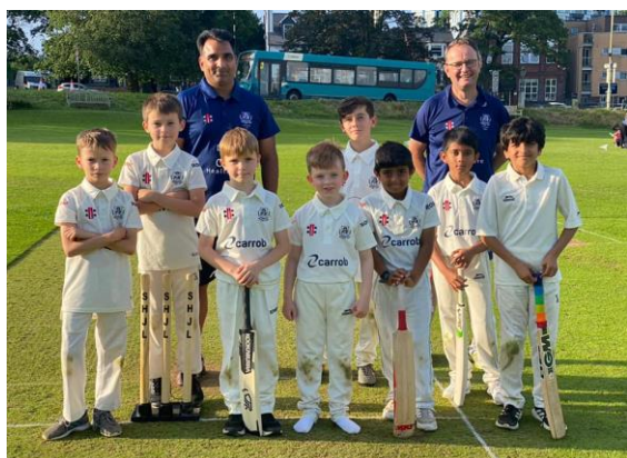
U9s enjoying a game on the main ground