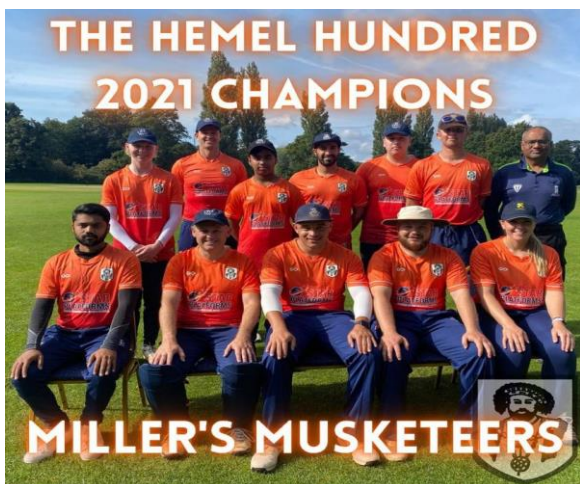
THE HEMEL HUNDRED 2021 CHAMPIONS MILLER'S MUSKETEERS