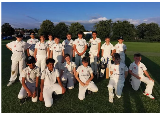
U12s As vs Bs