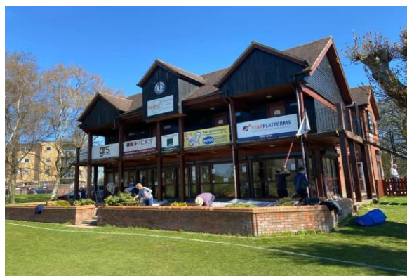
Working Party in action