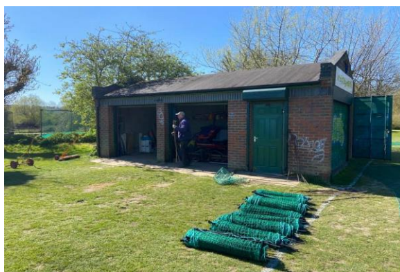
Ground preparation in full swing