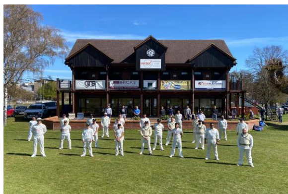
We are ready!