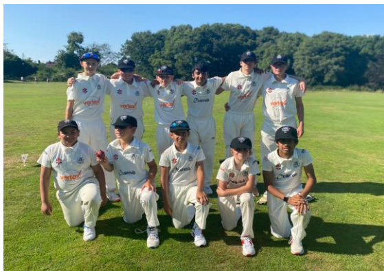
U14s County Cup Runners-up