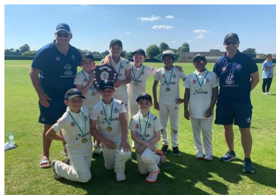
U12As were County Champions